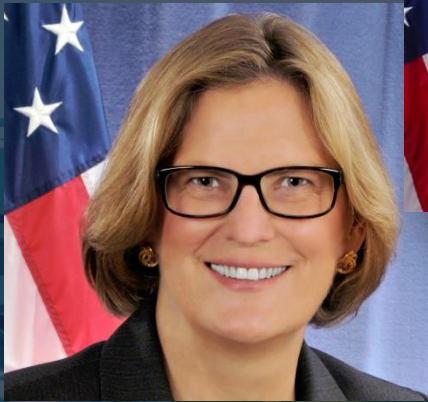
Dr. Kathy Sullivan Under Secretary of Commerce for Oceans & Atmosphere, Acting