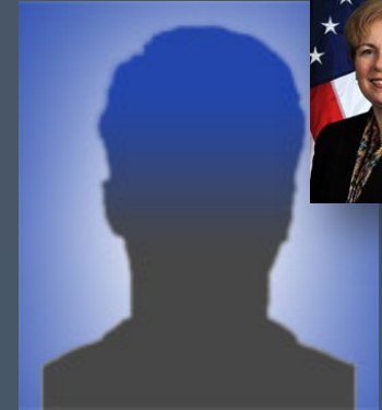
Principal Deputy Under Secretary for Oceans and Atmosphere